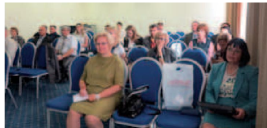
Delegates from the Ural region